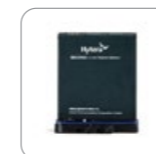
Battery (3000 mAh)