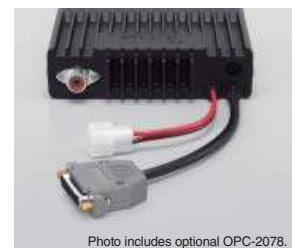
Photo includes optional OPC-2078.

The optional ACC cable allows you to connect with various external devices to control audio output, modulated signal input, remote channel control, horn honk and many more functions. OPC-1939 is a D-SUB 15-pin type and OPC-2078 is a D-SUB 25-pin type.